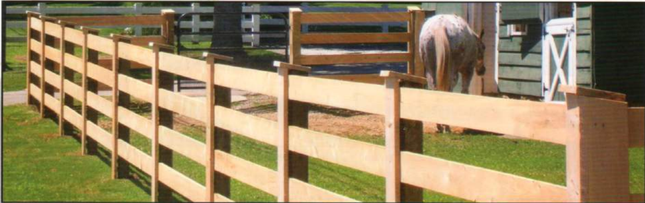
4 Board round treated post 1"x 6"x 16' Hemlock board, w / faceboard and cap.