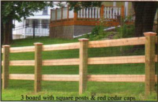
3 board with square posts & red cedar caps