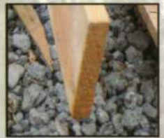
1" x 6" Hemlock Board