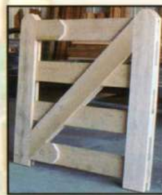
4 Board Gate

Posts are available in pressure treated pine wood, or rough sawn locust. Boards are available in 1" x 6" x 12' Rough sawn hemlock, or pressure treated pine Board spacing is 12 & 15" on center. In 3 or 4 board