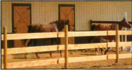
3 Rail Slip Board, 3" x 6" Treated Posts, 1" x 6" x 12' Hemlock Boards