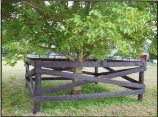
Cross-buck fence painted black