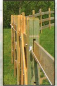
5" x 5" End Post